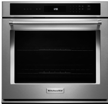
Stainless Steel KOST100ESS