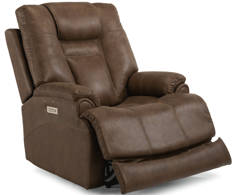
1714-50PH in fabric 814-72