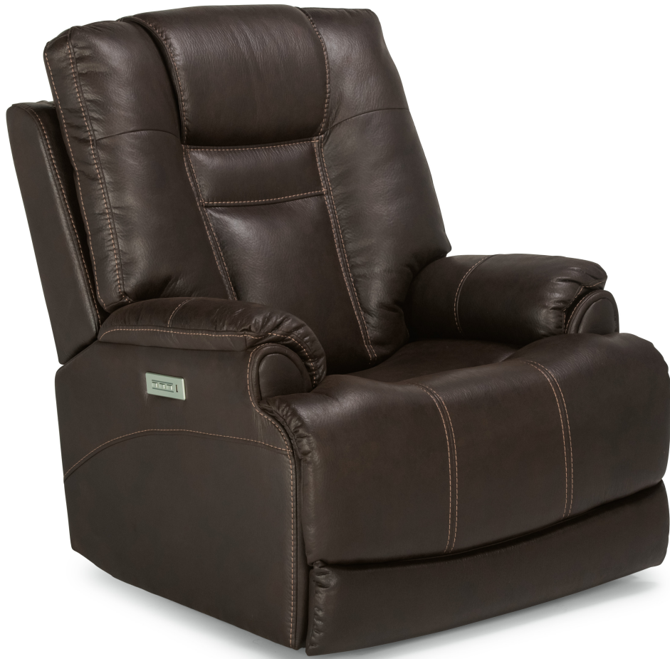
1714-50PH in fabric 814-70