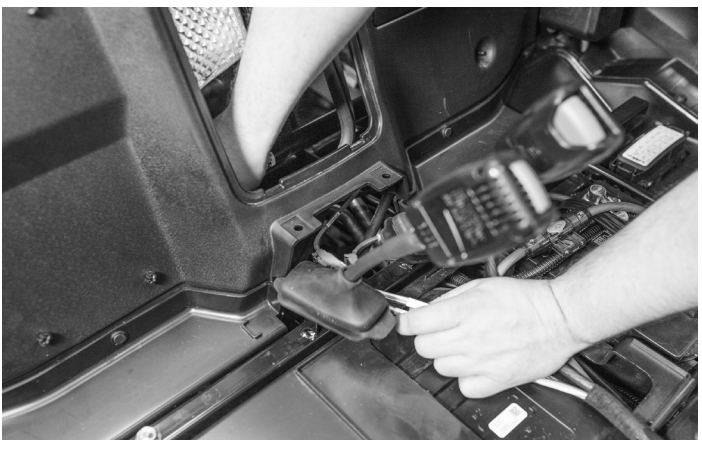
Feed both wires under the access panel and connect to RFRZ-4KD or RFRZ-PMXWH1 rear speaker harness.

Be sure that the center console is removed to gain access to the wire harness.