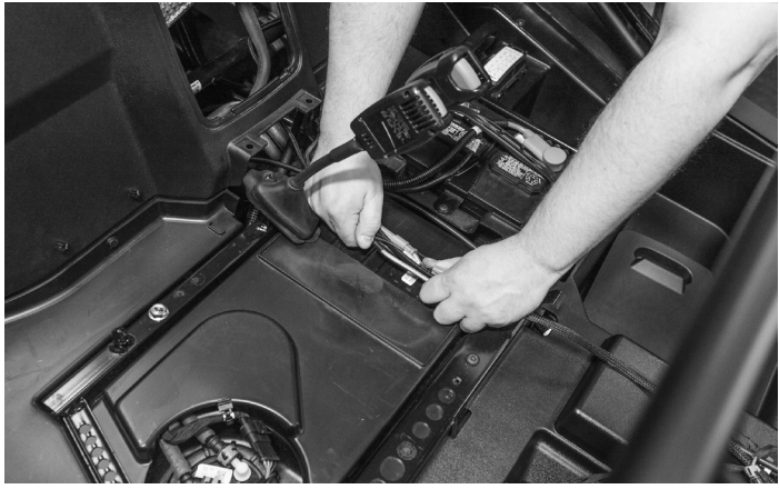
Once connected, bundle up any slack in the harnesses and wire tie wrap to hold in place.

Install the center console and access panel.