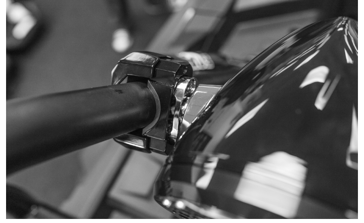
Step 2 - Attach Wake Can Speaker Enclosure to Bracket

NOTE: Be sure to leave enough slack so you can connect the speaker to the connector.