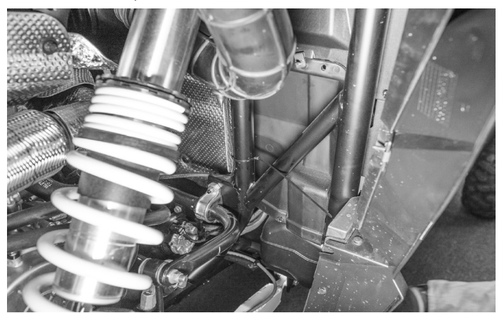
Route the harness toward the center of the vehicle toward the rear access panel.

Follow the tube down towards the front of the vehicle and attach with wire tie wraps.