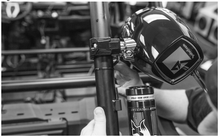
Step 3 - Route Speaker Wire Harness

NOTE: A safety lanyard is supplied with the wake cans for additional safety. Refer to wake can instructions for a more detailed installation guide.