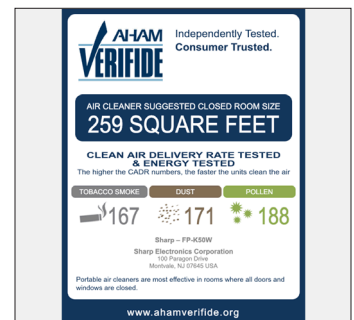
Sharp Air Purifiers are tested by independent laboratories to verify the air-cleaning capability of the filtration system