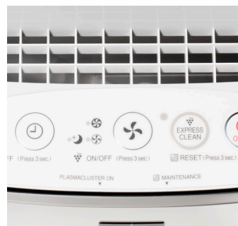
Patented Plasmacluster® Ion Technology reduces germs, bacteria, viruses, mold & fungus