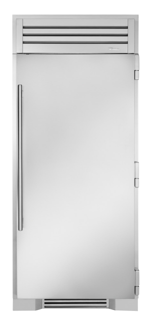
TR-36FRZ-R-SS-A Door Closed

36" Freezer (Right or Left Hinged) With Solid Stainless Steel Door