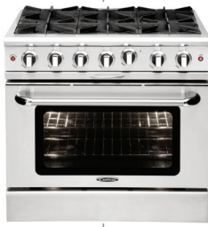
Manual Clean MCOR36