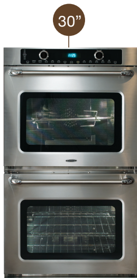
Double Self Clean Wall Oven MWOV302ES