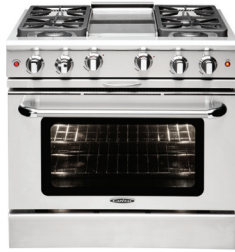
Manual Clean MCR36