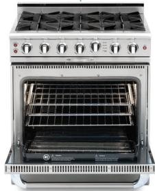
Self Clean CGSR36