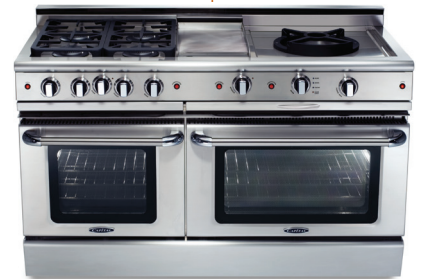
Self Clean GSCR60