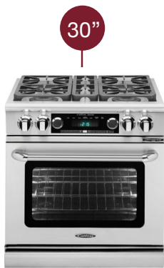
Self Clean CSB30

Power-Flo™ sealed burners were designed with efficiency in mind. They use less gas at higher BTUs; saving precious natural resources while delivering astounding levels of power and control. Rated at 19,000 BTUs/hr and able to turn down to a true simmer, they are the highest input sealed burners on the market.