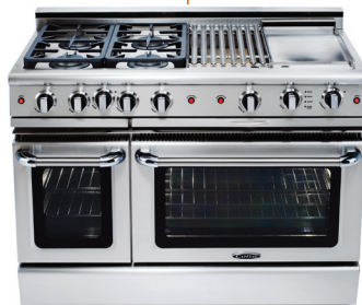
Self Clean GSCR48