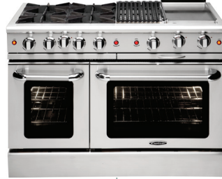
Manual Clean MCOR48

With a design that perfectly blends the look of commercial & residential, the Culinarian provides optimal heat delivery, power & function.