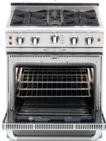
Self Clean CGSR30