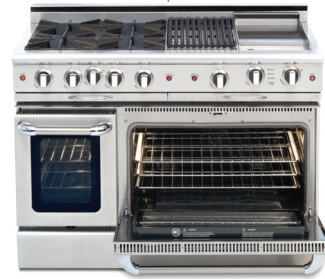
Self Clean CGSR48