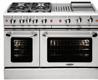
Manual Clean MCR48

Offering the largest oven capacity in its class, the 30" Precision manual clean range offers an impressive 4.9 cu. ft. interior capacity.