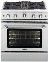
Manual Clean MCOR30