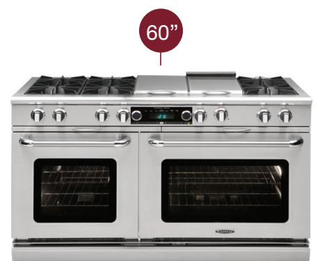
Self Clean COB60