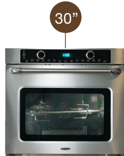
Single Self Clean Wall Oven MWOV301ES