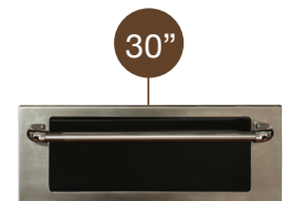
Warming Drawer MWD30ES