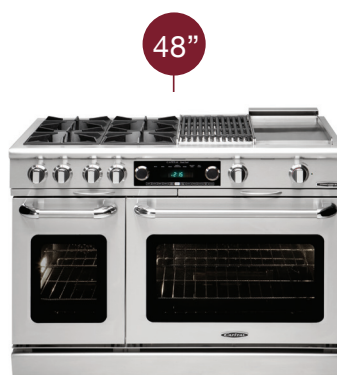
Self Clean COB48