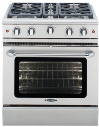
Manual Clean MCR30