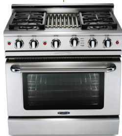
Self Clean GSCR36