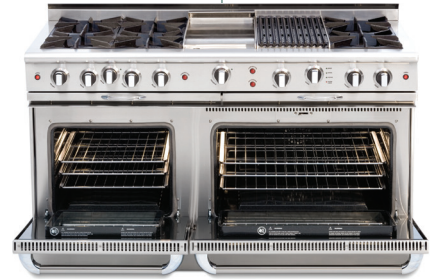
Self Clean CGSR60