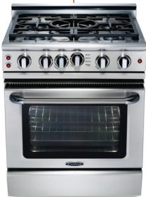
Self Clean GSCR30