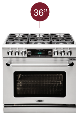
Self Clean CSB36