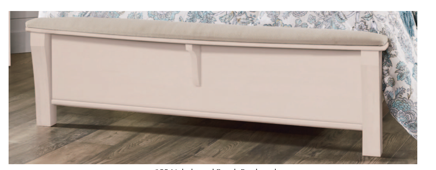
-355 Upholstered Bench Footboard