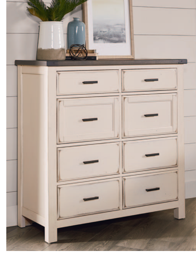
-004 Linen Chest - 8 Drawers