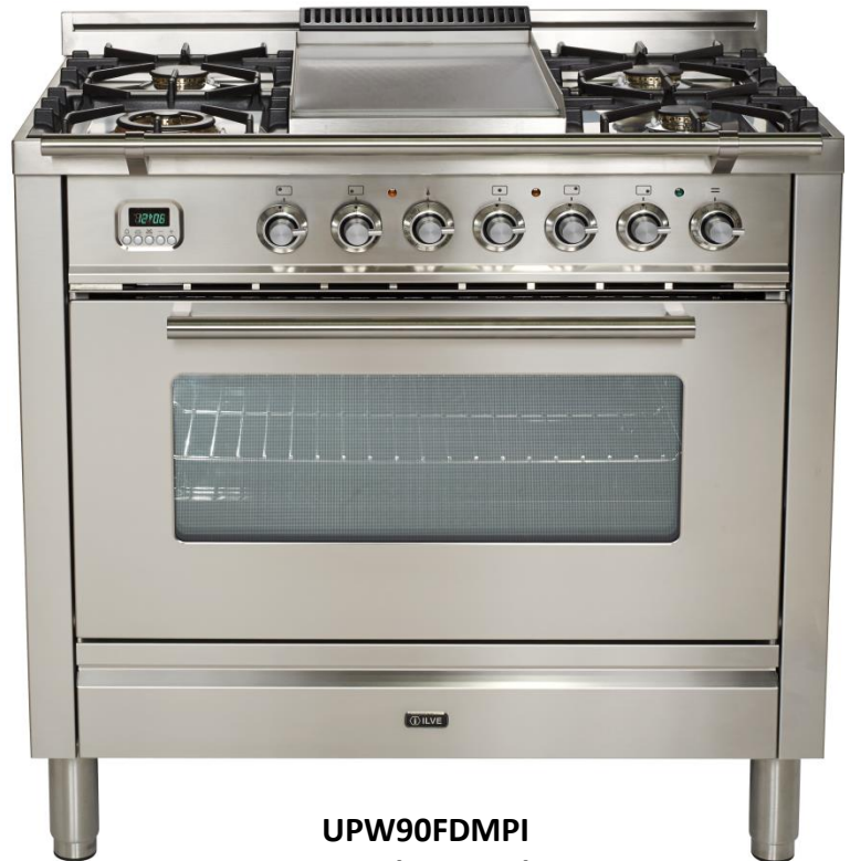
UPW90FDMPI Stainless Steel