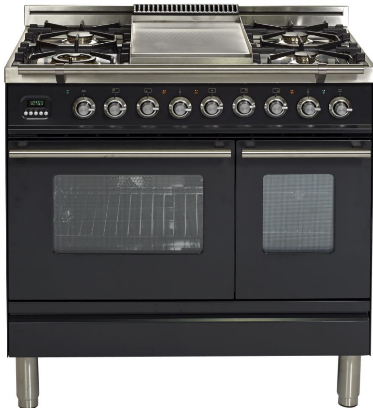
UPDW90FDMPI Stainless Steel