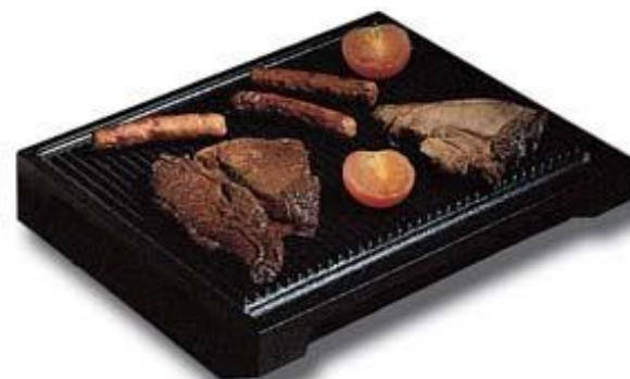
Cast Iron Steak Pans Ribbed Large Flat Large Ribbed Small Flat Small