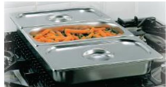
Stainless Steel Basins with Lids for heating food in Bain-Marie. Used with griddle-fry-top only, this is composed of 3 baskets and covers and 1 container.