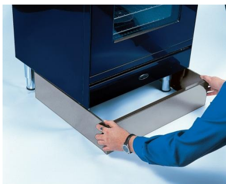
Wrap Around Toe Kick 3 Stainless Steel Panels Majestic ONLY