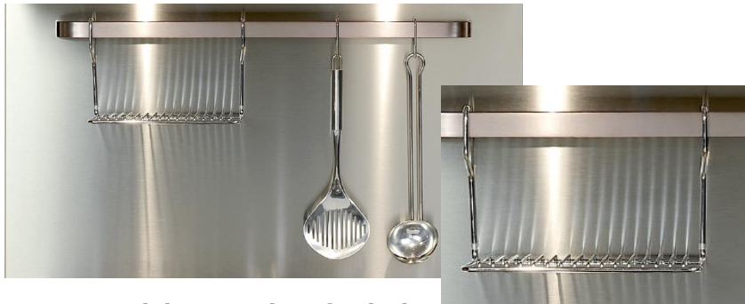
Stainless Steel Backsplash