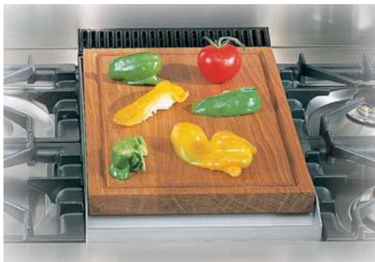
Chopping Board Solid 15/16" thickness. Seats into griddle/fry-top plate