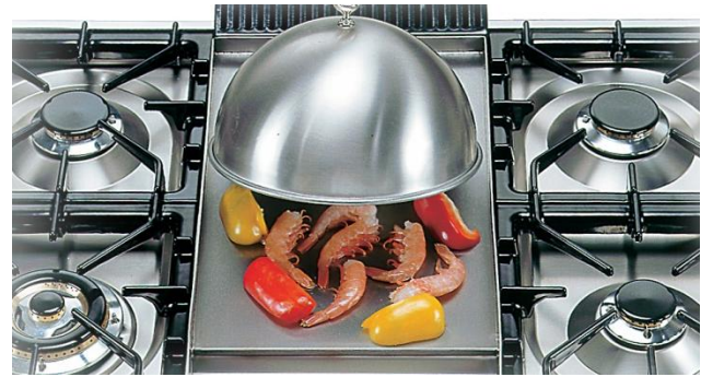
Cover for Fry-Top Grilling Steam remains inside the cover making foods more tender