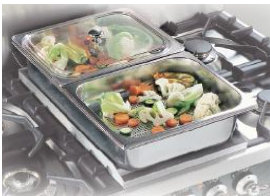
Basins for Steam Cooking Composed of 2 Containers with 2 lids. Steam Cooking is a healthy, ideal method for meat, fish, rice or vegetables