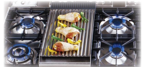
Gas Barbecue Grill Use on Griddle/Fry-Top models only Gas BBQ grill is interchangeable with Griddle/Fry-Top plate when grilling.