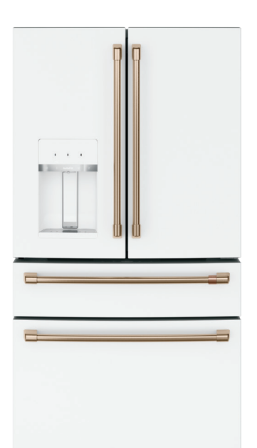
CVE28DP4NW2 Matte White with Brushed Bronze handles