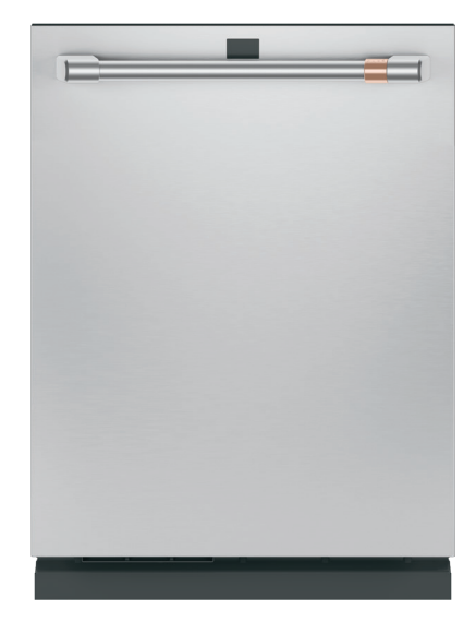
CDT855P2NS1 Stainless steel with Brushed Stainless handles