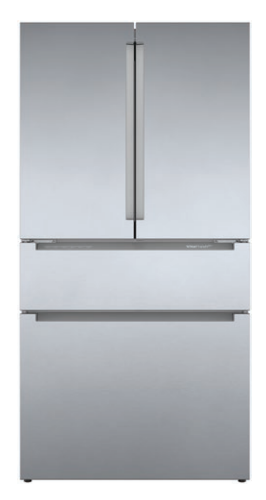
B36CL80ENS Stainless Steel w/ Recessed Handles

Introducing the revolutionary, new FarmFresh System™, with four freshness technologies designed to work together to keep your food fresher, longer. Enjoy less food waste, new innovative features and more thoughtful design.