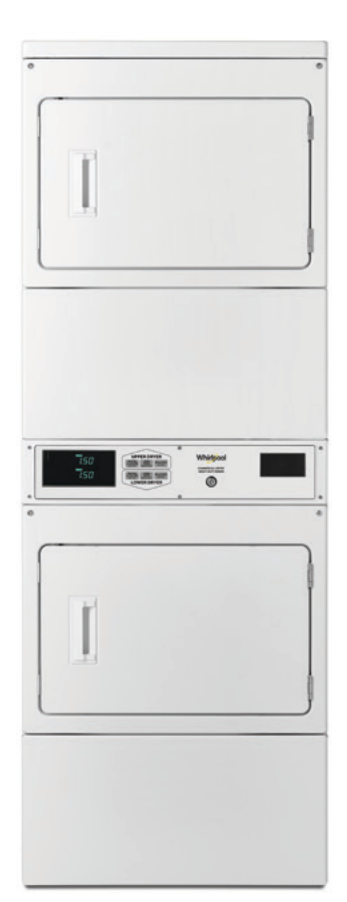
CSP2970HQ / CSP2971HQ

Why Buy: Get the capacity of two dryers in the space of only one.