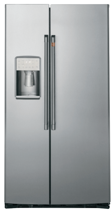
CZS22MP2NS1 Stainless steel with Brushed Stainless handles