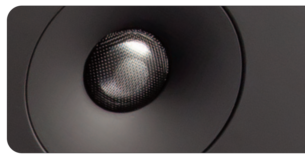
Mesh tweeter guard and WaveGuide™

Series 7 tweeters are satin-anodized pure-aluminum (S-PAL™) vs. the titanium of earlier generations, ferro-fluid cooled and damped. Highs are more soaring and spacious, crystal clear and undiluted even at the highest output. Note the new wire mesh tweeter guard (you've seen this in our ultimate high-end Signature Series). Not simply protection for the S-PAL™ tweeter, the mesh and WaveGuide™ technology do a superb job of dispersing sound across a wide listening area.