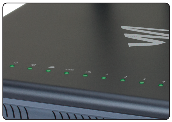
Epic 3 Front Panel View