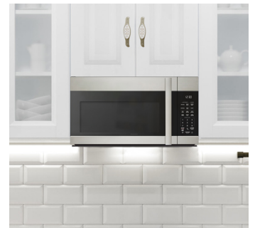
The sleek edge-to-edge stainless steel and black glass design is an elegant look to your kitchen

Product specifications and design are subject to change without notice.