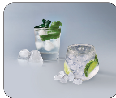
Dual Ice Maker with Ice Bites™