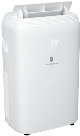
ZCP08SA, ZCP10SA, ZCP12SA