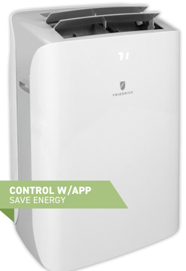
ZCP08SA, ZCP10SA, ZCP12SA