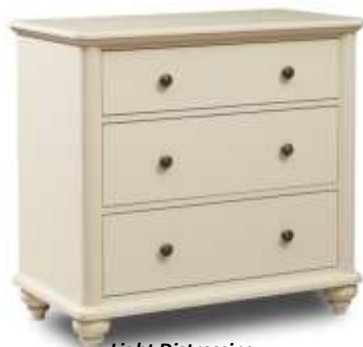
Light Distressing 3203 Southbrook