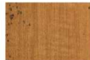
AGED WHEAT *Heavily Distressed