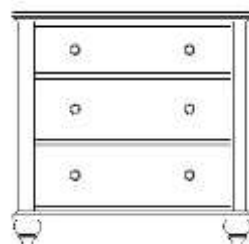
166 Single Dresser