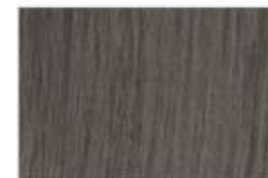
DUSK *Premium Finish