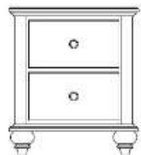
202 Night Stand