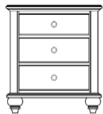
203 Night Stand