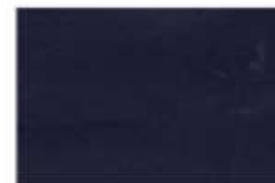
NAVY *Premium Finish