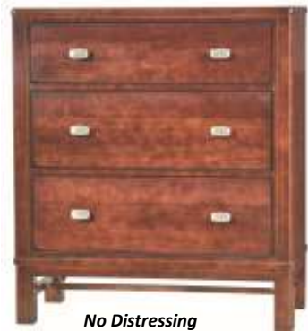
No Distressing 3201 Westend