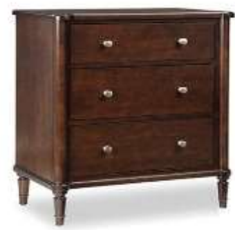
Light Distressing 3215 Highbury