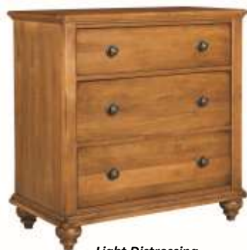
Light Distressing 3202 Millcroft