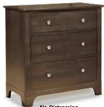
No Distressing 3207 Montgomery