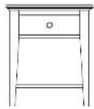
205 Night Table