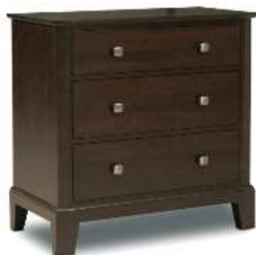
No Distressing 3205 Urbane