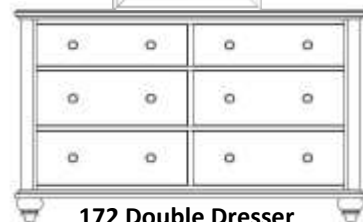
172 Double Dresser