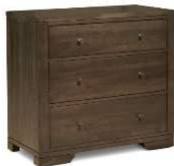
No Distressing 3208 Symmetry