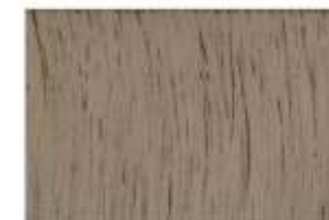
BRUSHED TAUPE *Premium Finish