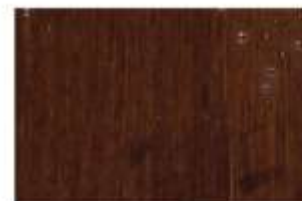
ANTIQUE RYE *Heavily Distressed