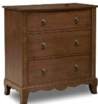
Light Distressing 3204 Montelena