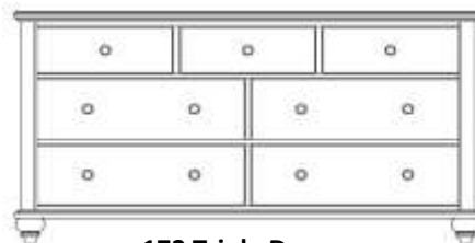
173 Triple Dresser