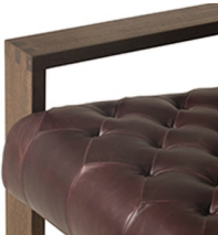
HIGH RESILIENCY FOAM SEATING