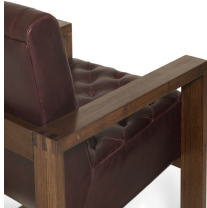
TIGHT BACK CUSHIONS WITH MEMORY FOAM