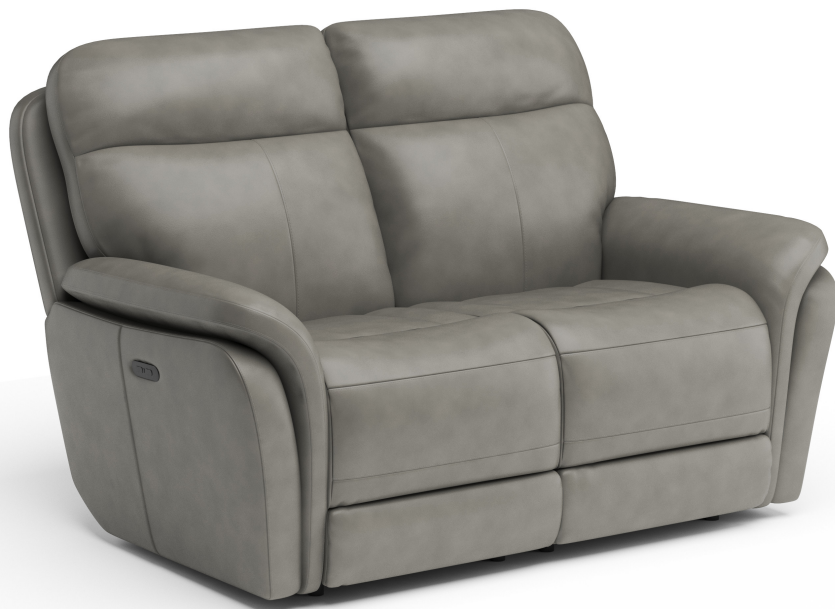
1653-60PH in Leather 360-01