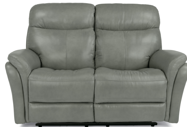
Leather Power Reclining Loveseat with Power Headrests 1653-60PH in 360-01