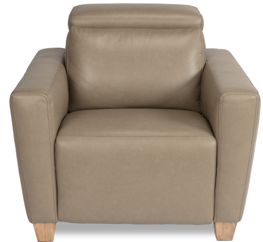
Power Recliner with Power Headrest 1309-50PH in 326-82