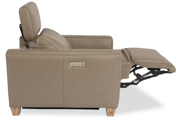
Power Recliner with Power Headrest 1309-50PH in 326-82