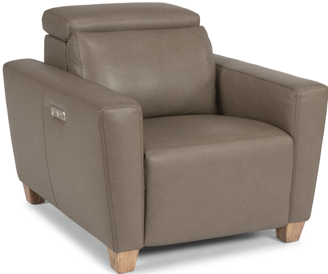
Power Recliner with Power Headrest 1309-50PH in 326-82