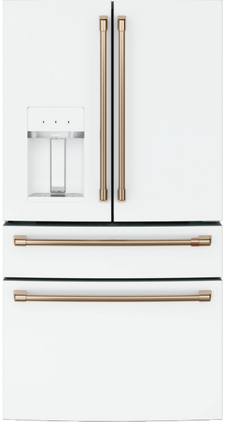
CXE22DP4PW2 Matte White with Brushed Bronze handles