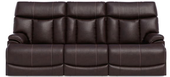
1595-62PH in Leather 375-70