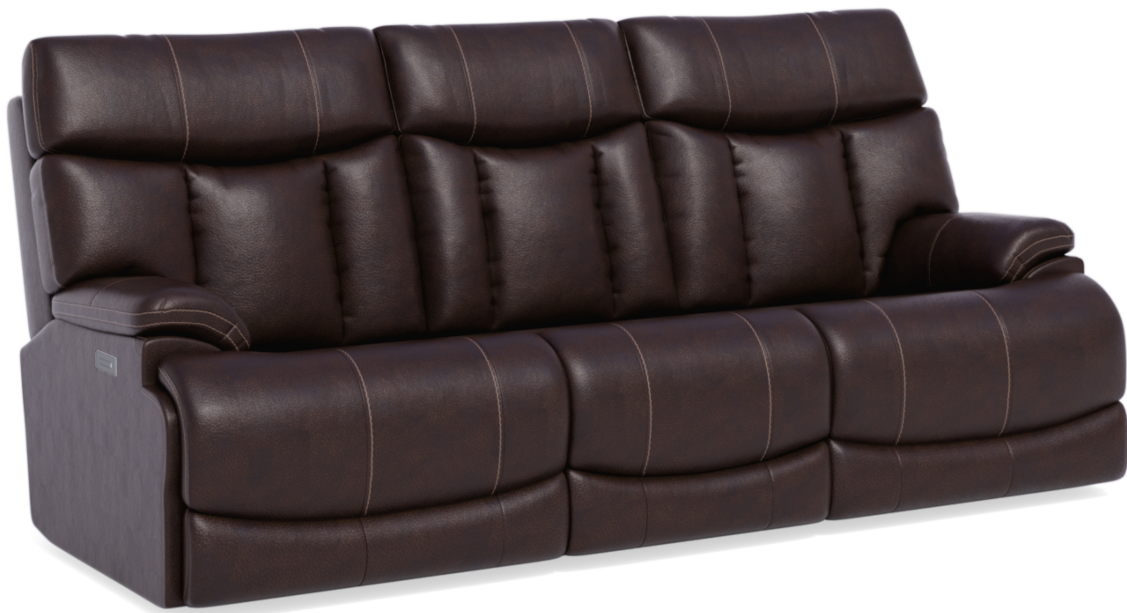
1595-62PH in Leather 375-70