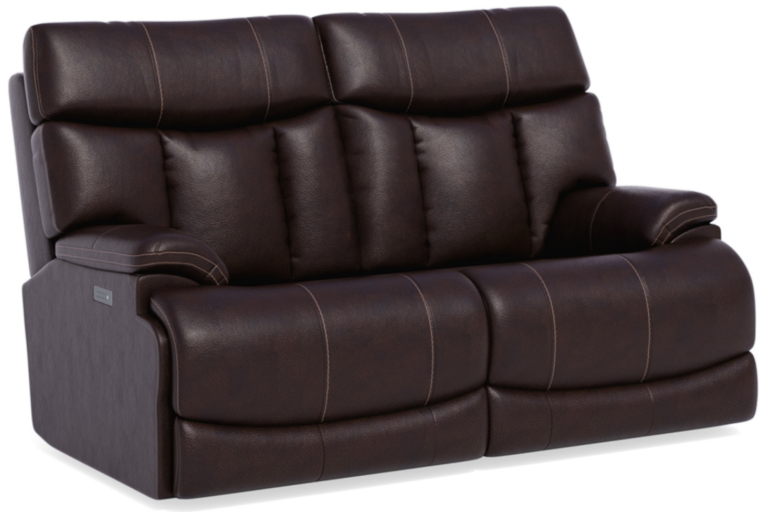
1595-60PH in Leather 375-70