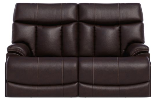
1595-60PH in Leather 375-70