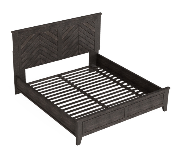
PANEL BED KING W1004-90K 52"H x 81"W x 87"D