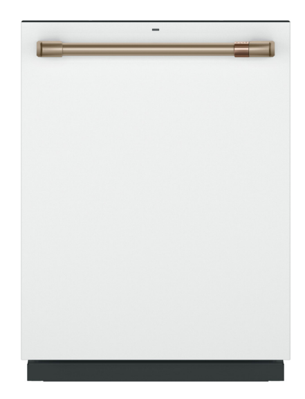
ALSO AVAILABLE IN