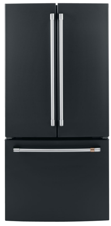
ALSO AVAILABLE IN

CWE19SP2NS1 Stainless Steel with Brushed Stainless handles