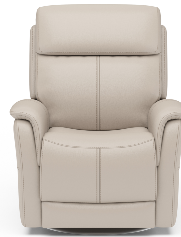
1524-52PH in Leather 050-01