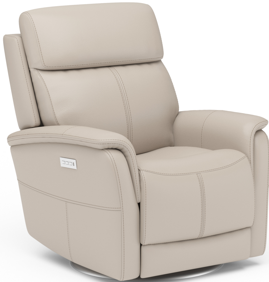
1524-52PH in Leather 050-01