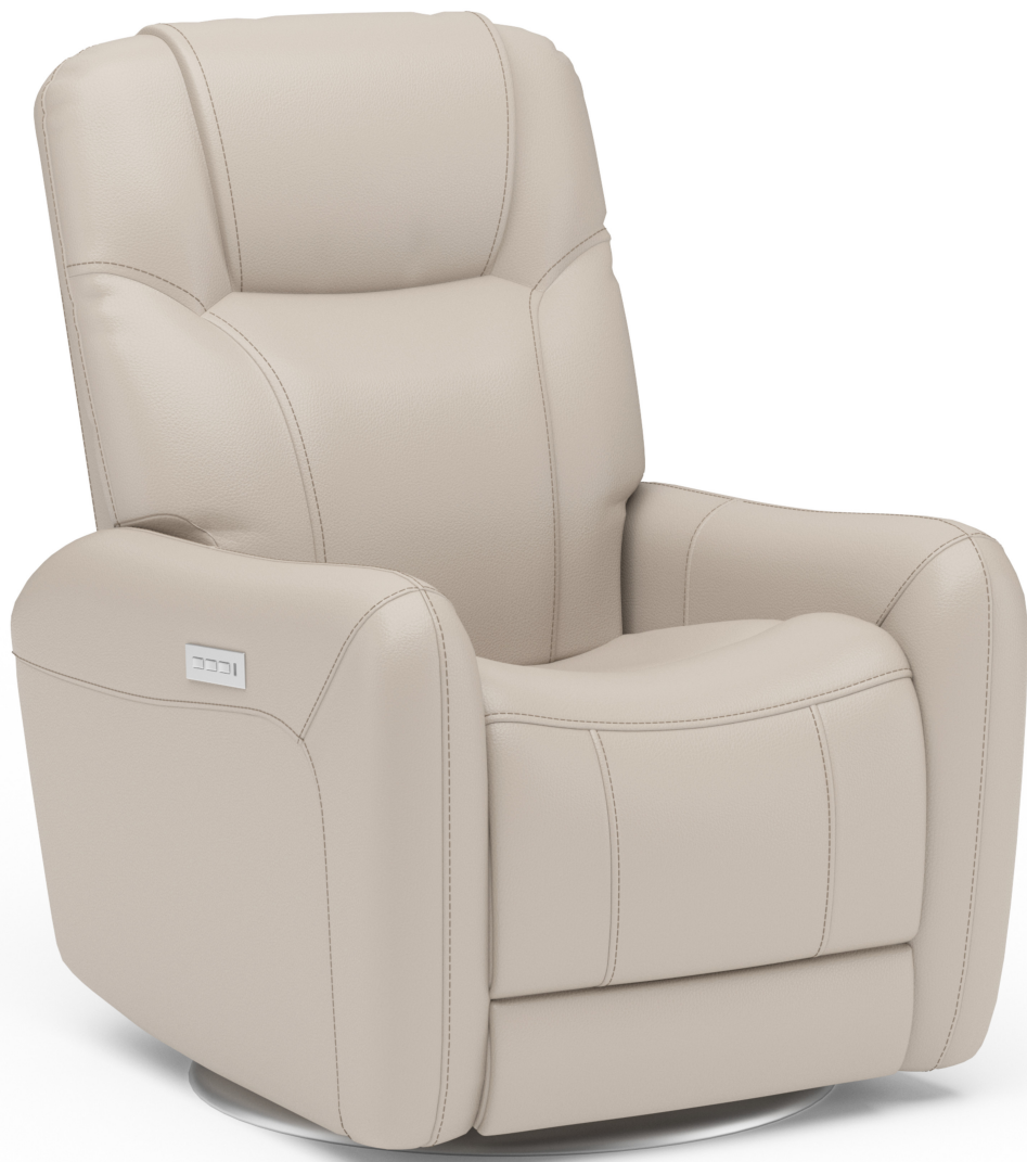
1514-52PH in Leather 050-01