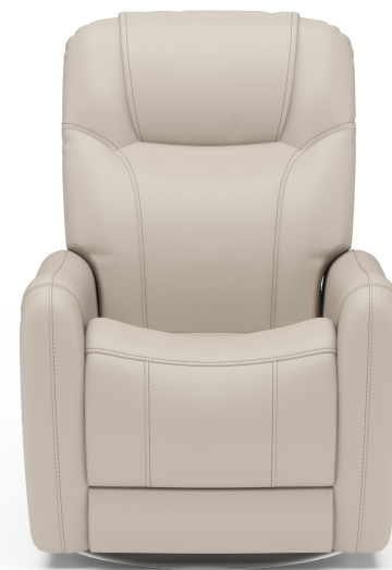
1514-52PH in Leather 050-01