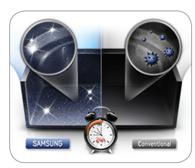
Ceramic Enamel Interior