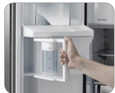
Auto Water Fill