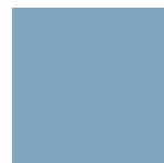
DUCK EGG BLUE