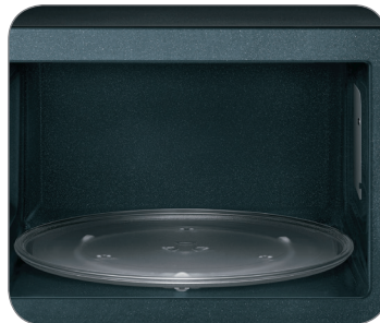
Ceramic Enamel Interior